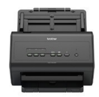
Business Document Scanners