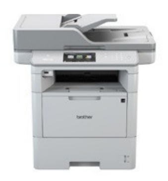
Professional Monochrome Laser Devices