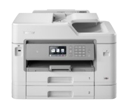
Business Inkjet Devices